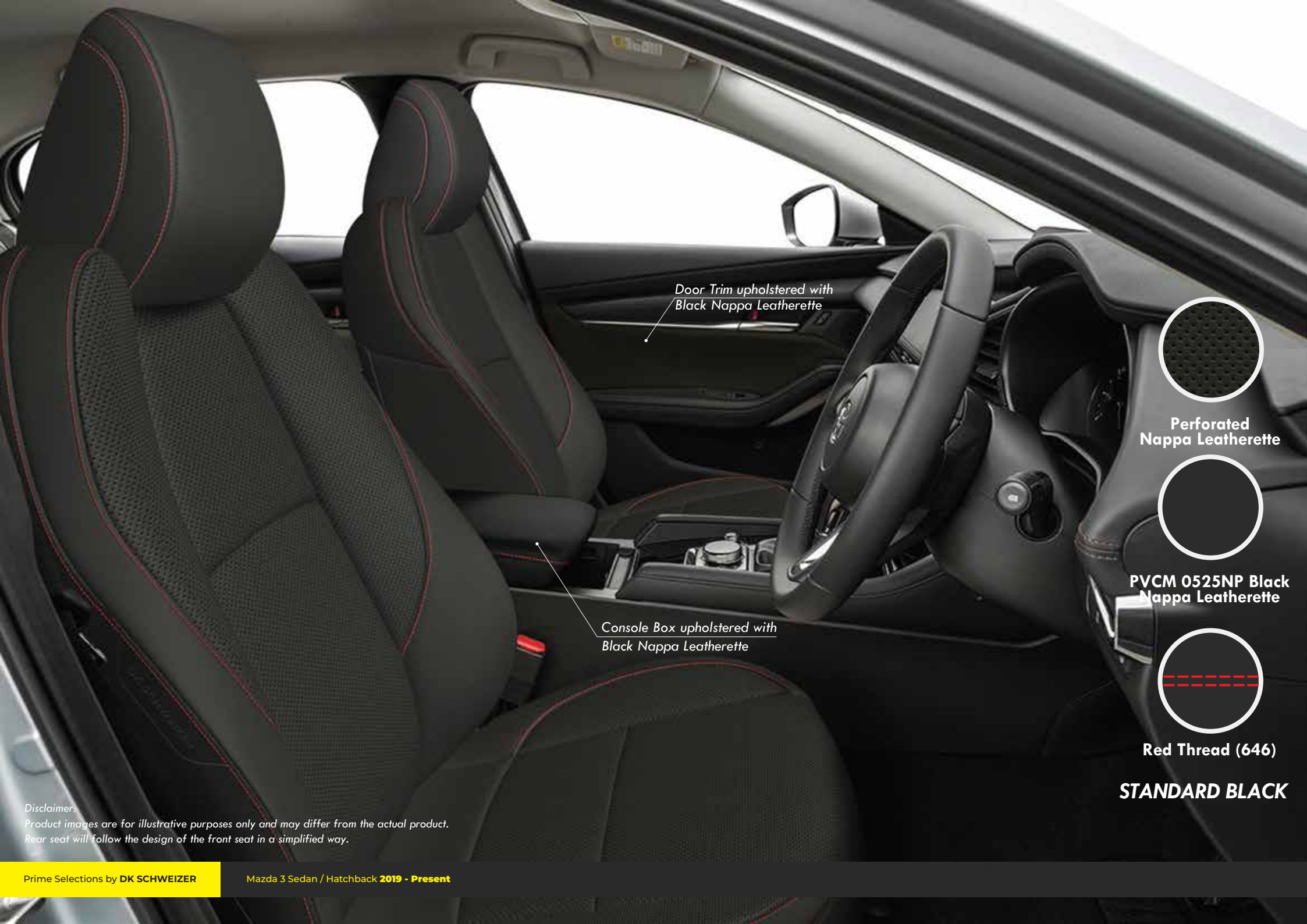
Door Trim upholstered with Black Nappa Leatherette