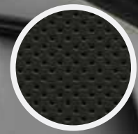
Perforated Nappa Leatherette