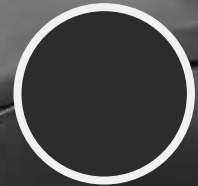
PVCM 0525NP Black Nappa Leatherette