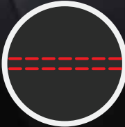
Red Thread 646