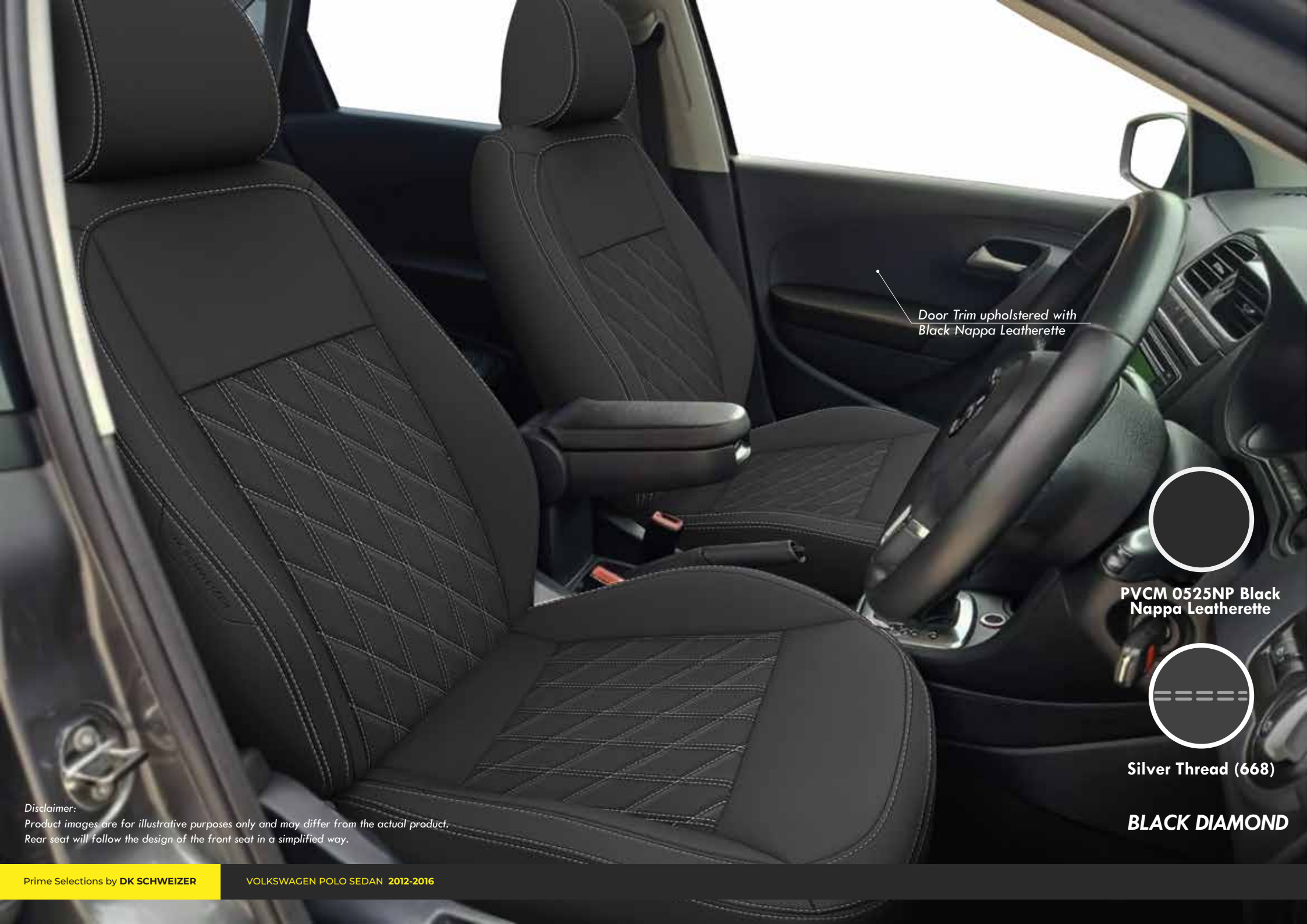
Door Trim upholstered with Black Nappa Leatherette