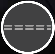
Silver Thread (668)