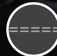
Silver Thread (668)