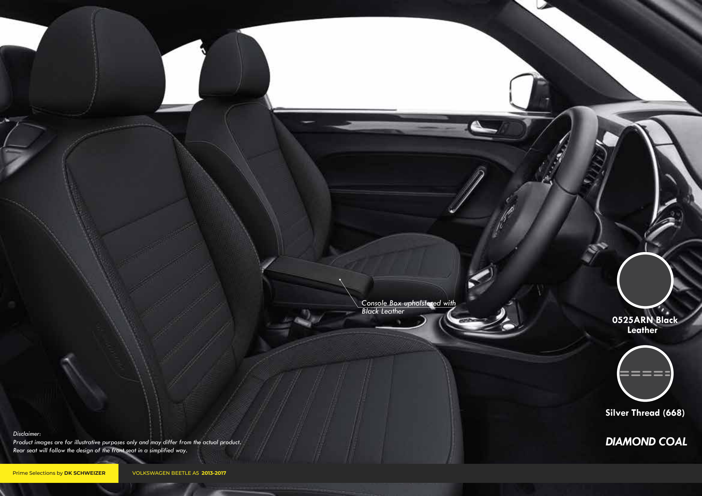
Console Box upholstered with Black Leather