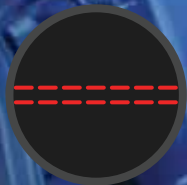
Red Thread (646)