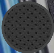
Perforated Nappa Leatherette