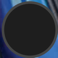
PVCM 0525NP Black Nappa Leatherette